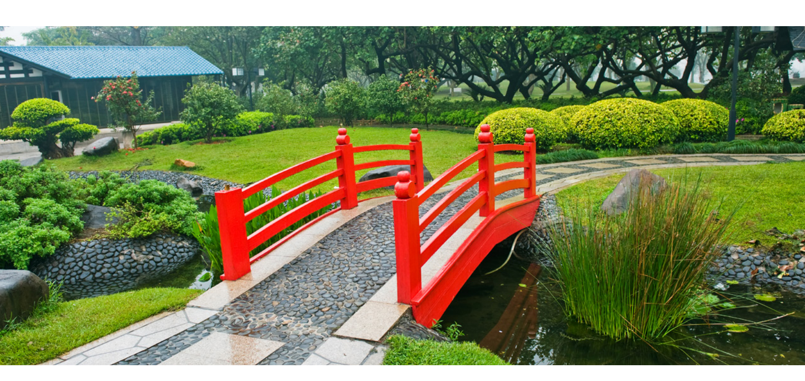
SureBridge® is a registered trademark used for both insurance and non-insurance products offered by subsidiaries of HealthMarkets, Inc. Supplemental and life insurance products are underwritten by The Chesapeake Life Insurance Company®. Administrative offices are located in North Richland Hills, TX. Products are marketed through independent agents/producers. Insurance product availability may vary by state.