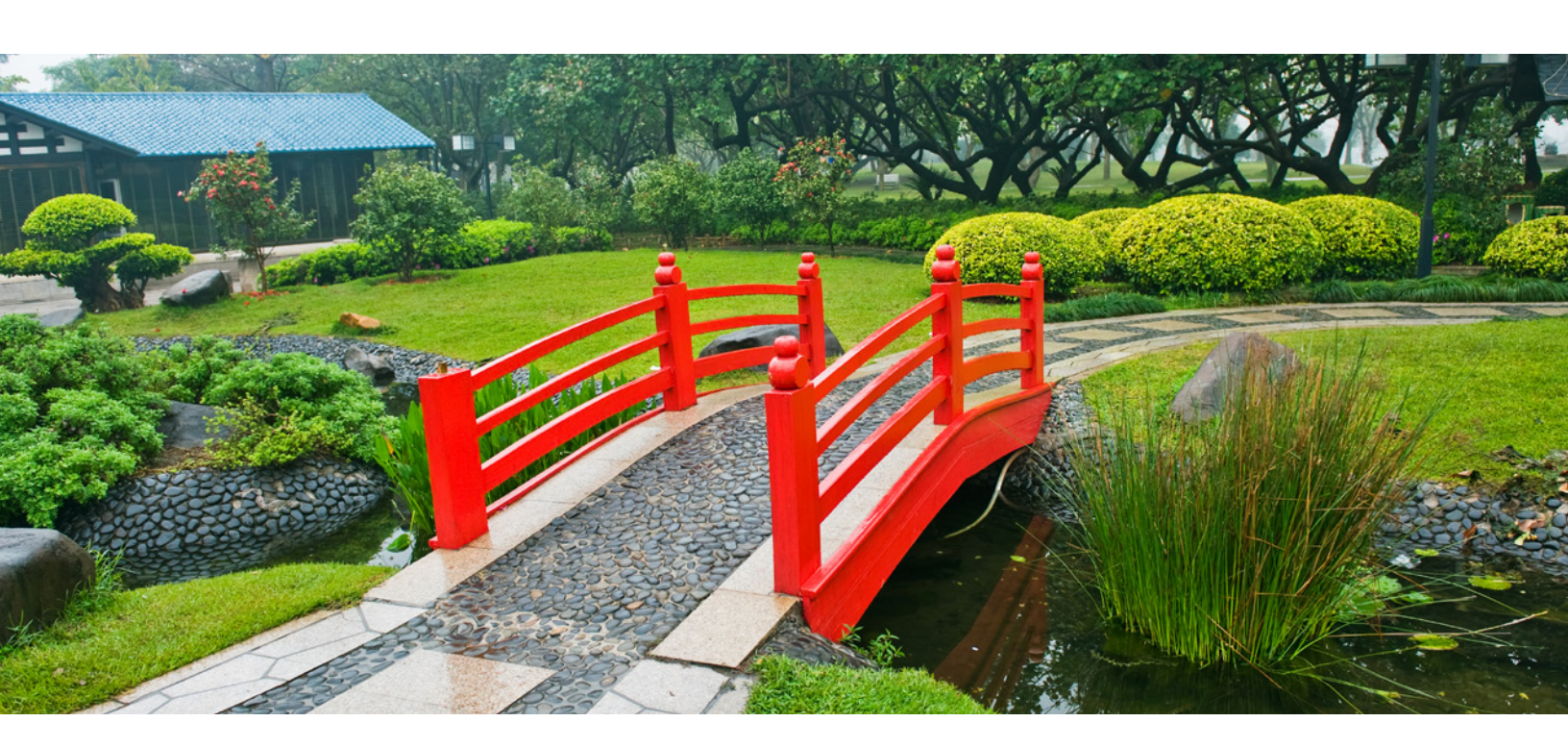
SureBridge® is a registered trademark used for both insurance and non-insurance products offered by subsidiaries of HealthMarkets, Inc. Supplemental and life insurance products are underwritten by The Chesapeake Life Insurance Company®. Administrative offices are located in North Richland Hills, TX. Products are marketed through independent agents/producers. Insurance product availability may vary by state.